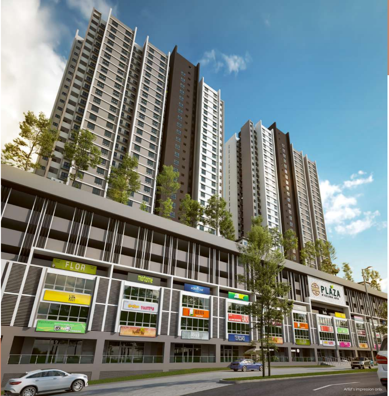
Artist's impression only.